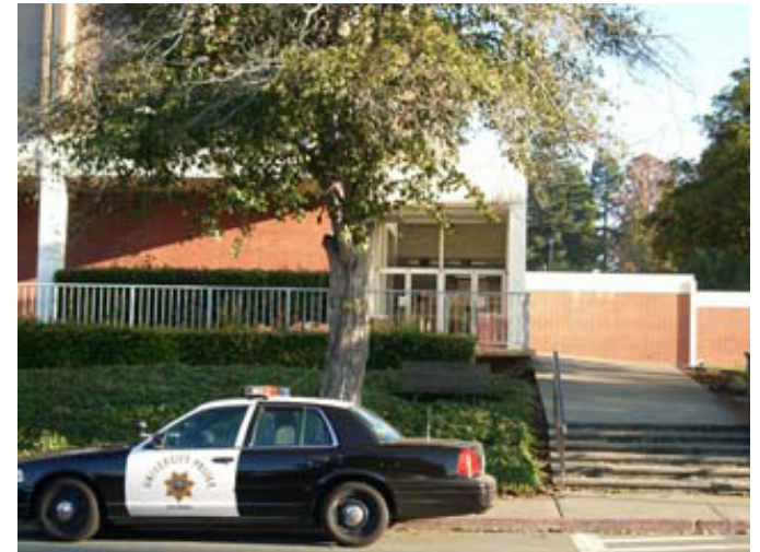
Entrance to PE Building at West Loop Road